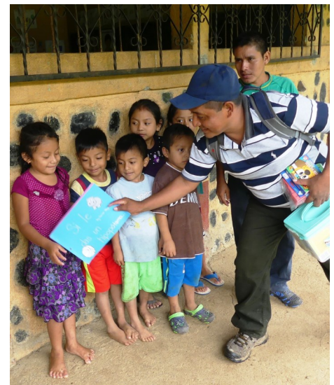
Student-authored books, gifts from Sandia Prep, Seacacar Elementary