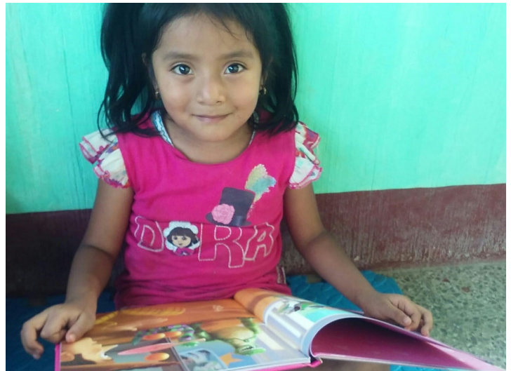
Jun Toj School, Rabinal, Guatemala

Entirely unplanned, From Books to Brilliance (FBTB) launched thirteen years ago, sparked by a three-week medical mission in the outlying Nicaraguan town of Mulukukú. Since that time, the trajectory of many lives has forever changed. Now with access to books and educational materials, children and adults in eleven underserved Central American communities gather to prepare for their very own future in their neighborhood libraries and schools. The power of literacy means local readers are steadily becoming tomorrow's leaders. And FBTB continues its work today, both in the USA and abroad. We thank the Dr. Seuss Foundation for getting us started. We thank you and so many organizations for steadfastly supporting this path to literacy along the way.