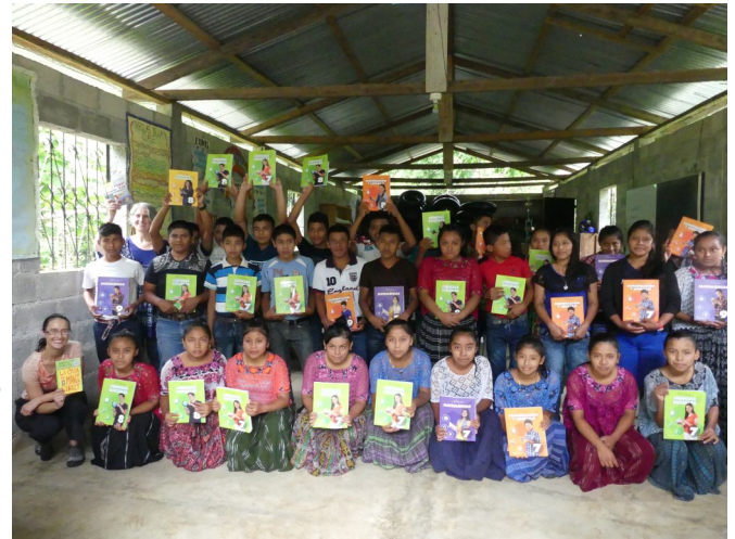
Textbooks for Seacacar, Guatemala