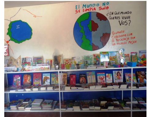
Biblioteca Frankfurt, San Pablo School, La Laguna, Nicaragua