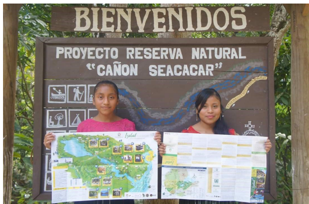
Now a tourist destination, the village of Seacacar just put itself on the map!

middle school students. Younger siblings play games and read charmingly illustrated stories. High-quality Guatemalan textbooks facilitate both teaching and learning. "Writing is improving; imagination is developing; students are motivated to read a variety of books; students' vocabularies are growing; they're becoming more thoughtful," say teachers. These resources are redefining education at Kajib' No'j.