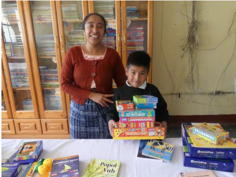
Kajib' No'j School, Momostenango

When IAG founded Kajib' No'j in Momostenango, Mayan youth studied for only two years. Now the school offers pre-school through ninth grade. The recently founded FBTB library holds a variety of literature, delighting