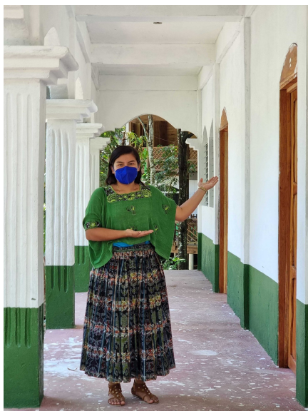
Welcome to Seacacar's public library, almost ready for readers!

Very soon the Seacacar community will be operating the first public library in the area. All people (children, youth, and even adults) will be welcome and have access to its books and resources.