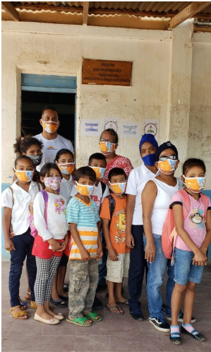
Biblioteca El Pantanal

Thanks to FBTB and its supporters, six small libraries located in the poorest of neighborhoods surrounding Granada serve their communities. This beautiful project benefits youth from low-income families. Parents tell me that their children study with more enthusiasm and earn better grades in school, and teachers claim that before the pandemic attendance improved.