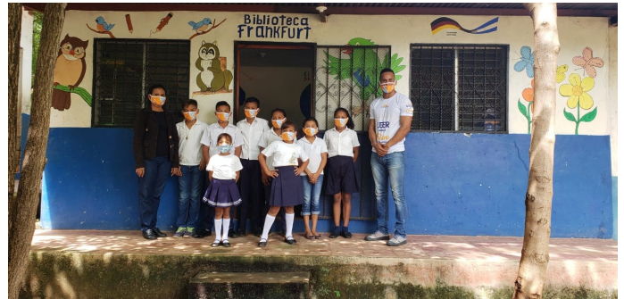
Biblioteca Frankfurt, La Laguna

Currently schools offer in-person classes only three times a week to minimize contagion. In my most recent visit to the schools, the teachers stressed the importance of having these materials to meet the required Nicaraguan academic standards. Teachers can plan lessons, facilitating instruction, and students can do their own research. In these communities, not so many years ago, there were few books or educational materials from which to learn. The parents are overjoyed with the ongoing support FBTB offers. Thank you all.