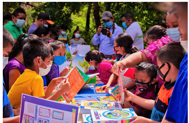
Books for two elementary schools, Seacacar Abajo and Seacacar Arriba

continue to collaborate with FBTB to create access to books and information in Seacacar. Children will soon be enjoying the resources now available in their community. We invite you all to come for a visit. The kids will be proud to show you around and read you a story in their very own library!